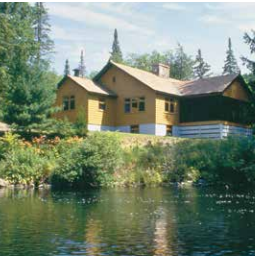
Des Pins Chalet